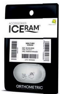
Pack with 2 units 21.02.2002